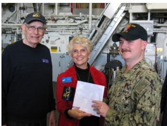
USS Sioux City LCS 11 BLUE