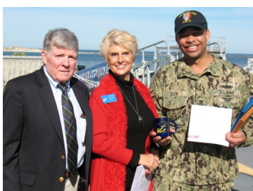
USS Sioux City LCS 11 GOLD