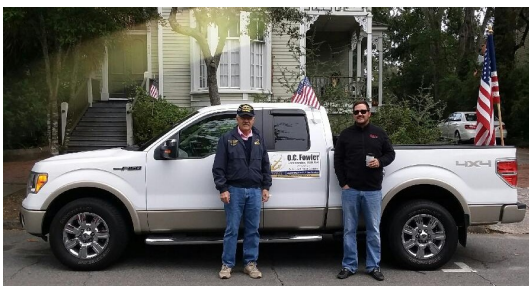
O.C. in Veteran's Day Parade