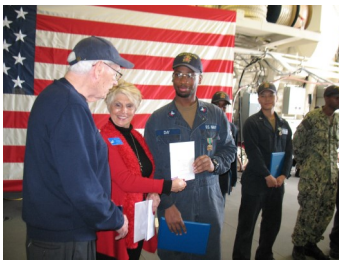
USS Little Rock LCS 9 GOLD

Following the Change of Command Ceremony, Sailor of the Quarter / Year awards were presented to our other adopted LCS Crews aboard both USS Little Rock and USS Sioux City.