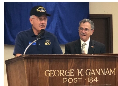
O.C. speaking at Veteran's Council Meeting 1 October