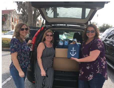
Baby Bags for USS Alaska