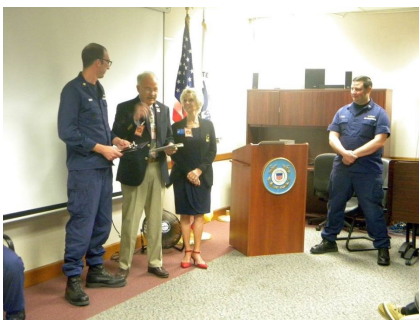
MST1 Schaus - MSU