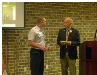
USCGC Pompano Sailor of the Year