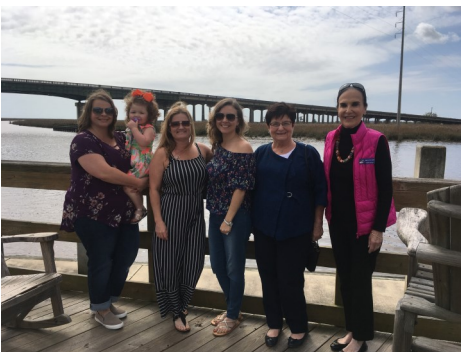
Alaska's GOLD FRG